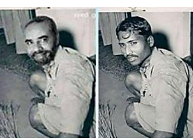
Remember That Photo Of Modi Sweeping The Floor? RTI Reply Has Confirmed Huffington Post India