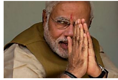
The Omens In Delhi: India Is Headed For A Constitutional Huffington Post India