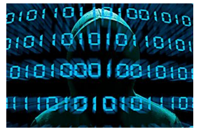
A Cyber Attack from a Hacker's Point-of-View Carbon Black