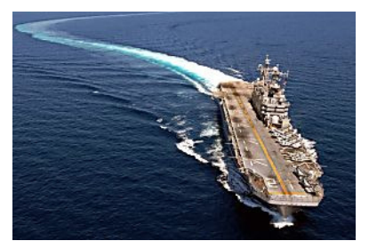
Maritime muscle in the South China Sea Policy Forum