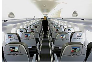
This Is the Dirtiest Place on an Airplane, According to a Microbiologist Newser